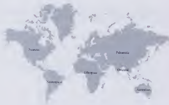
FIG. 1. Biogeographical regions according to Wallace (Cox, 2000).

examined and identified by Gomes & Thomé (2001), was considered. This material came from the Australian Museum (AM) (Sydney) (58 lots, 202 specimens), Field Museum of Natural History (FMNH) (Chicago) (25 lots, 119 specimens), Museu de Ciências Naturais da Fundação Zoobotânica do Rio Grande do Sul (FZB) (Porto Alegre) (4 lots, 42 specimens) and the Muséum National d'Histoire Naturelle (MNHN) (Paris) (15 lots, 37 specimens). Specimens were dissected as described by Thomé & Lopes (1973).